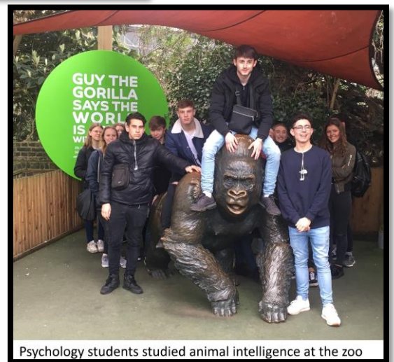
Psychology students studied animal intelligence at the zoo