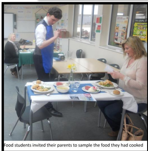
Food students invited their parents to sample the food they had cooked