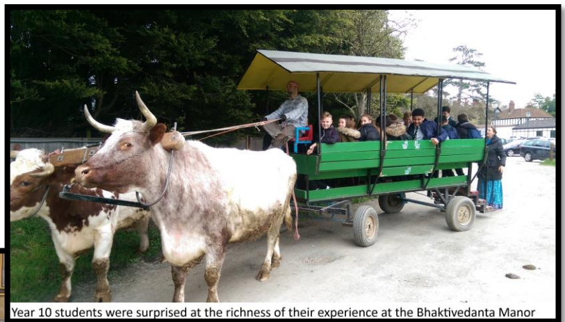
Year 10 students were surprised at the richness of their experience at the Bhaktivedanta Manor