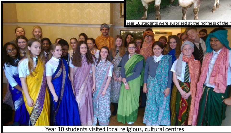
Year 10 students visited local religious, cultural centres