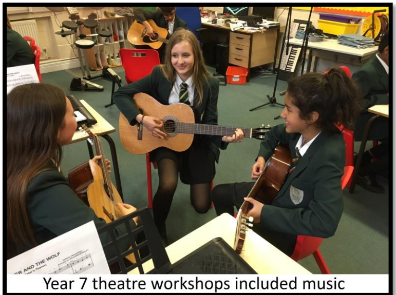
Year 7 theatre workshops included music