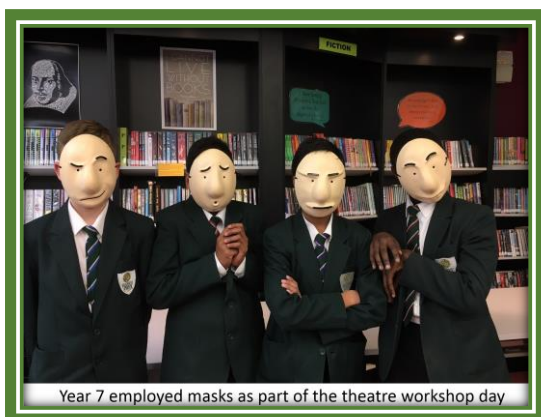
Year 7 employed masks as part of the theatre workshop day

The sixth form were presented with 17 different choices, comprising study days at school, community service supporting the enrichment days of other year groups in their own subject areas, or taking part in their own trips and visits.