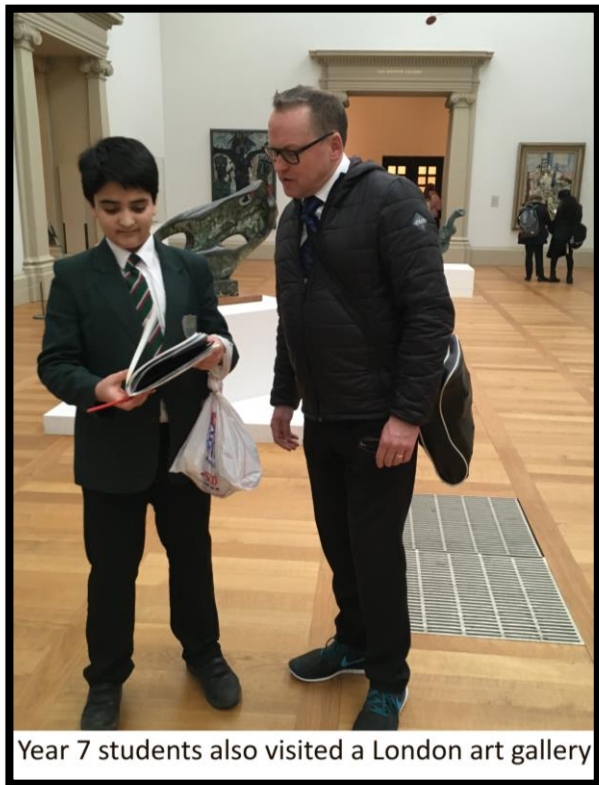
Year 7 students also visited a London art gallery