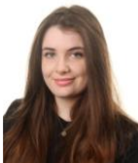
Theatre Brunel University London