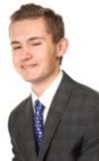
History University of Warwick

Other highly regarded universities such as Brunel, City and Surrey have also been popular choices as detailed below: