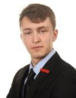
Psychology University of Surrey