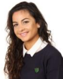
Law City University London