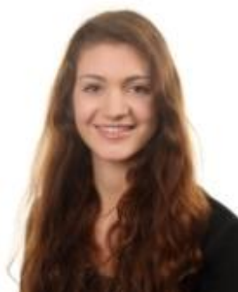
Psychology Cardiff University