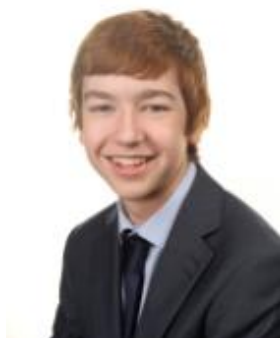
Computer Science University of Nottingham