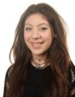
Law with Spanish University of Liverpool