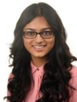
Law City University London